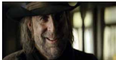
Carmax 'Candy Store'