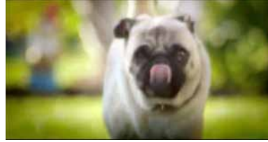
Kia Optima 'Epic Ride'