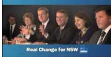
3. Liberal 'Jobs Action'