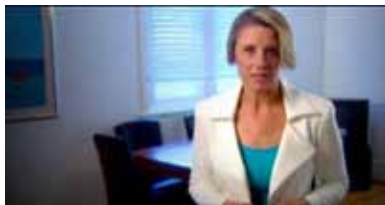
2. ALP 'Kenneally'