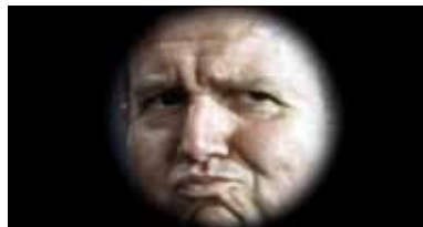
4. ALP 'Jobs Offshore'