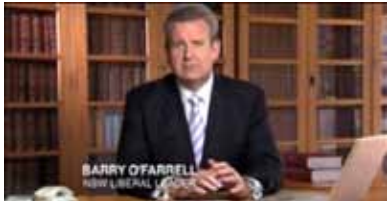
1. Liberal 'O'Farrell'