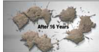
5. Liberal 'Mud Throwing'