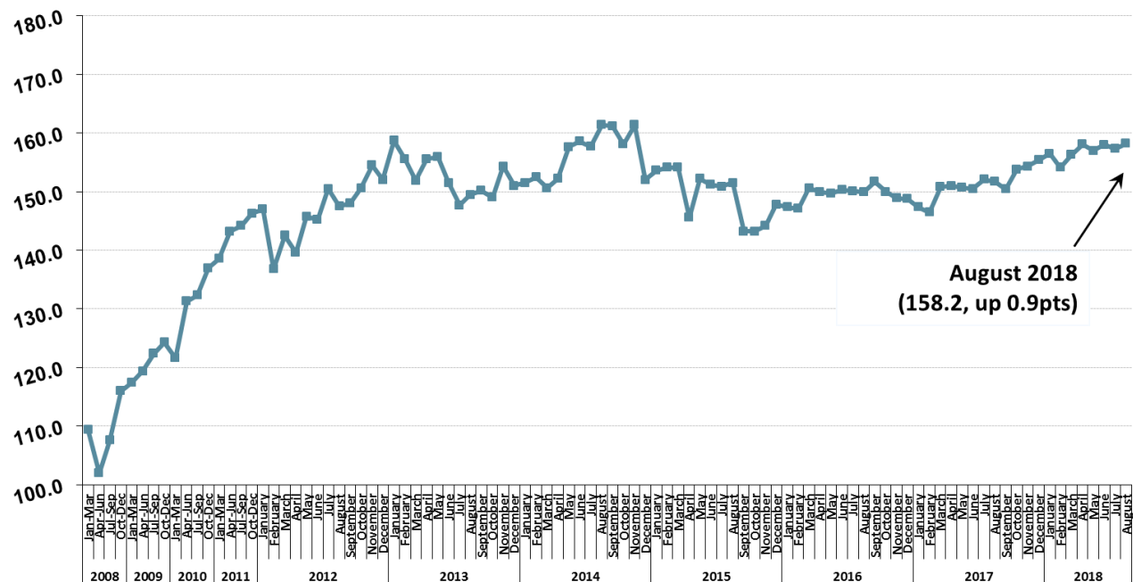
Roy Morgan Indonesian Consumer Confidence (2008 - 2018)

Source: Roy Morgan Indonesian Single Source: Indonesians aged 14+ August 2018 (n=1,282).