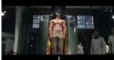
Captain America 'Trailer'