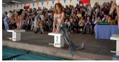
Carmax 'Candy Store'